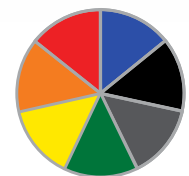
Standard Pallet Colors