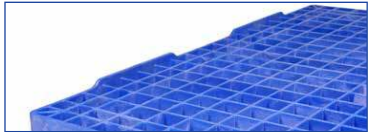
Optional perimeter lip available to better secure loads.