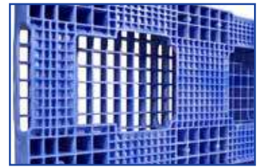
Conveyor system friendly runners.