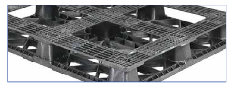
Runner attachment option allows for stacking / racking.