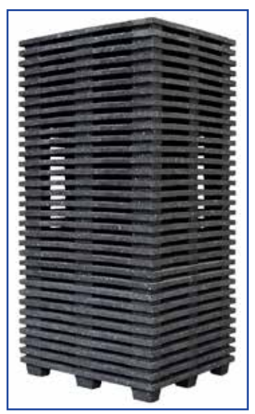
35 pallets fit in a full truckload stack