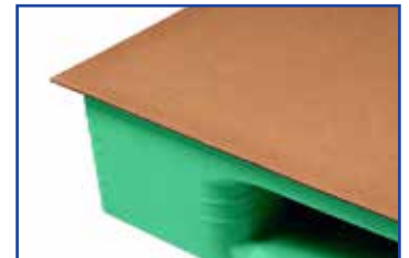
Smooth top deck, no lip option, ideal for slip sheet application.