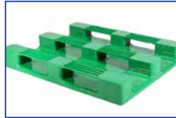
3-Runner bottom deck design.