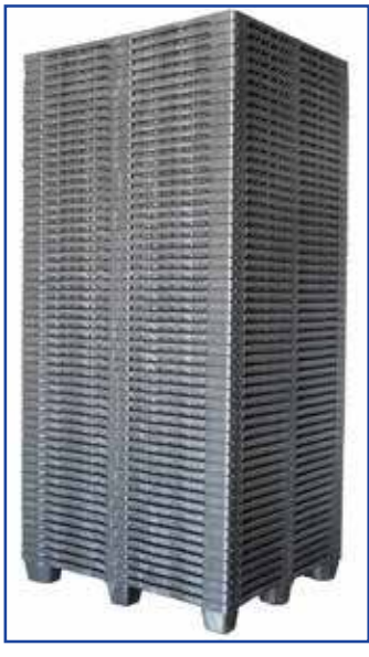
55 pallets fit in a full truckload stack.