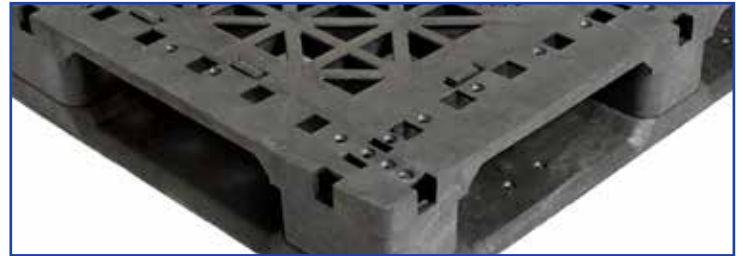
Top deck grommets to better secure pallet loads.