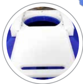
Slide gate, made from high density polyethylene